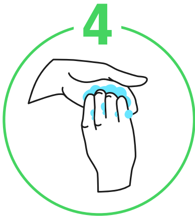
The back of the fingers