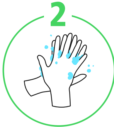
The backs of hands