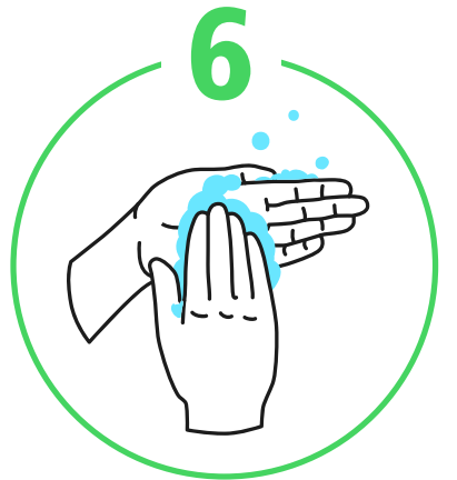
The tips of the fingers

Use a tissue to turn off the tap. Dry hands thoroughly.