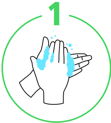
Palm to palm

Wash your hands with soap and water more often for 20 seconds