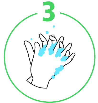
In between the fingers